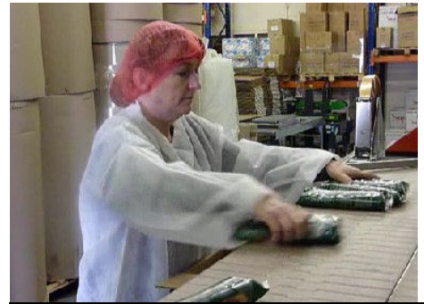
Products presented to the operator linearly so no scrabbling for packs on a Lazy Susan.

Predominantly manufactured from Stainless Steel and Aluminium with all components protected to IP65 makes the RE100 suitable for chilled, frozen, ambient and washdown environments.