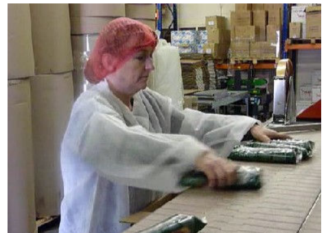
Products presented to the operator linearly so no scrabbling for packs on a Lazy Susan.

Predominantly manufactured from Stainless Steel and Aluminium with all components protected to IP65 makes the RE100 suitable for chilled, frozen, ambient and washdown environments.