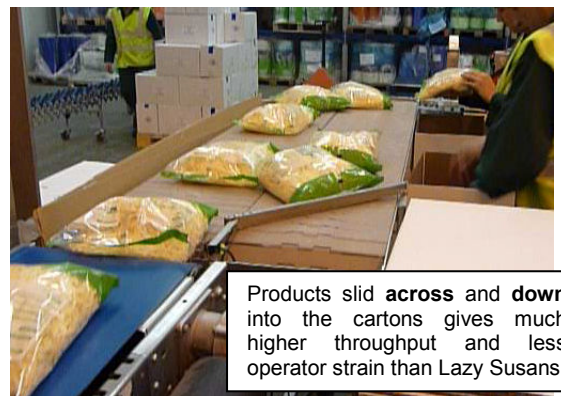
Products slid across and down into the cartons gives much higher throughput and less operator strain than Lazy Susans.

With over 40 man years experience of supplying labelling and automation solutions for the retail supply chain combined with an acclaimed design we believe you won't find a better value for money or more reliable systems on the market.